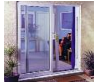
2 pane in-line sliding doors