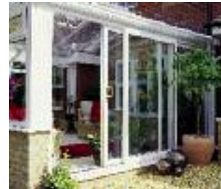
3 pane in-line sliding doors