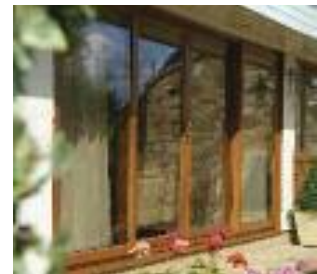
4 pane in-line sliding doors